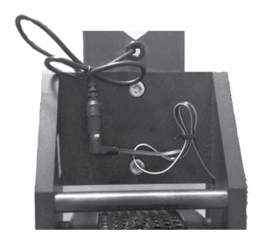
BACK OF THE FLYWHEEL

There is a 3.5 mm "male" black electrical connection cable / plug that originates from the flywheel – you will need to connect this to the electrical size reducer adaptor cable in your console box in order to allow this to be fitted into the 2mm "SPD" jack in the rear of the onboard console - the 3.5 mm "female" jack that originates from the flywheel and size reducer adaptor cable simply plug into each other.